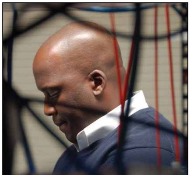
RESI network engineers untangle even the most complex networks.

RESI engineers have the following certifications: Cisco CCNA and CCNP, and Microsoft MCP, MCSA, and MCSE.