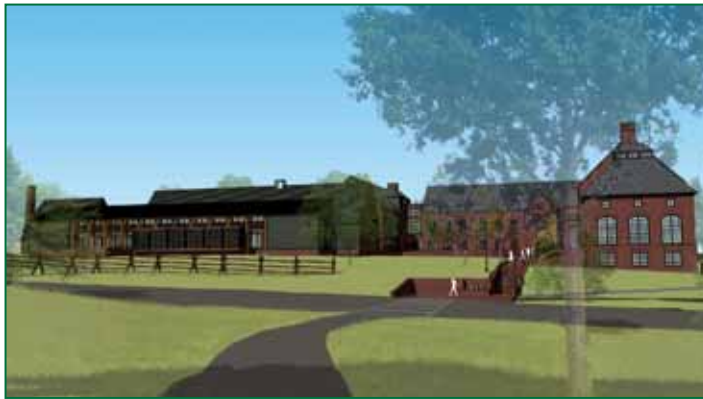
Anne Arundel Hall St. Mary's College