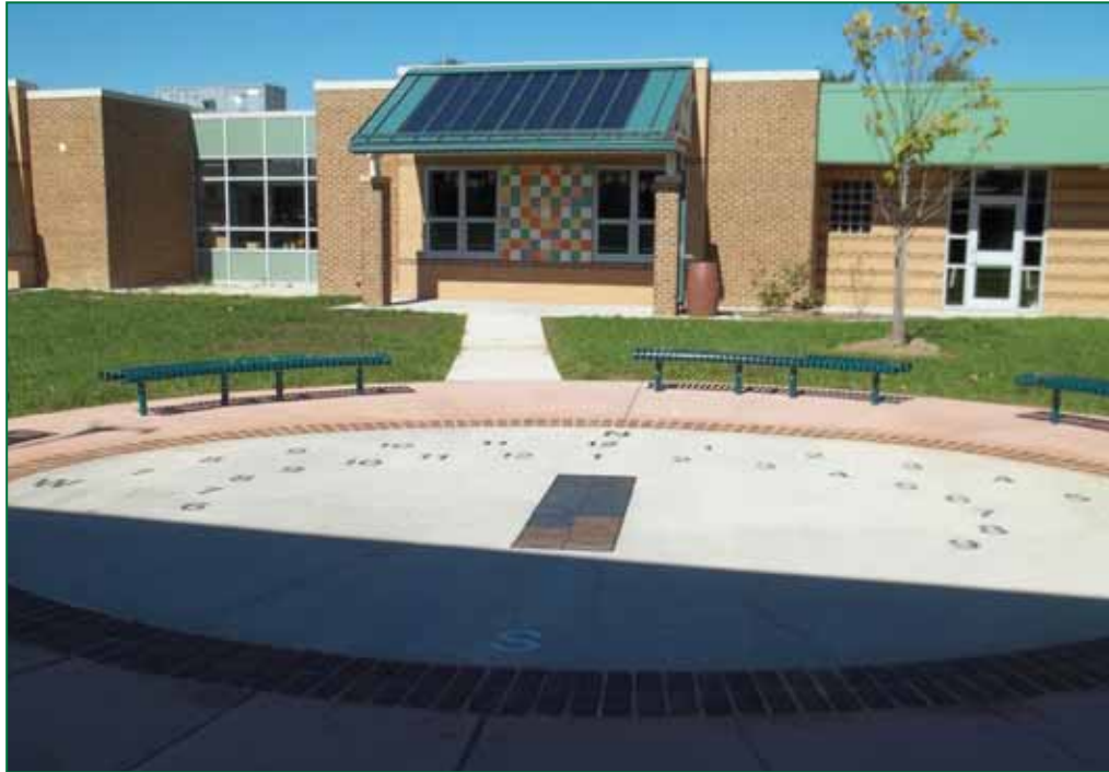
Northfield Elementary School, Howard county - note rain barrels and Photo Voltaic panels

Maryland's Interagency Committee on School Construction (the IAC), which administers the Maryland Public School Construction Program (the PSCP), promotes a number of policies and practices that support green building practices in Maryland's schools: