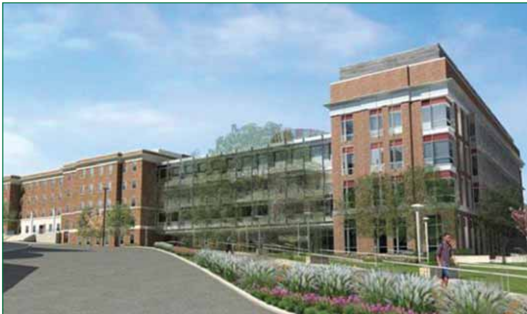
UMCP: Physical Sciences Building

The green building program continues to inspire green efforts in projects outside of the requirements of the high performance building act. St. Mary's College reports that they have moved Margaret Brent Hall rather than demolishing and replacing it. The 4,510 gsf building will provide academic office space and classroom space and is being upgraded with energy-efficient windows and HVAC systems. The College is also constructing a 230-car pervious parking lot and has converted 22 acres of lawn into meadows and forest.