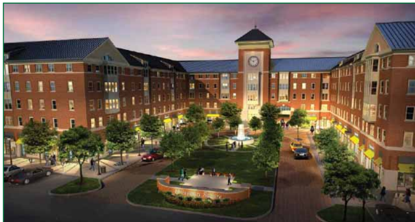
Towson University Square