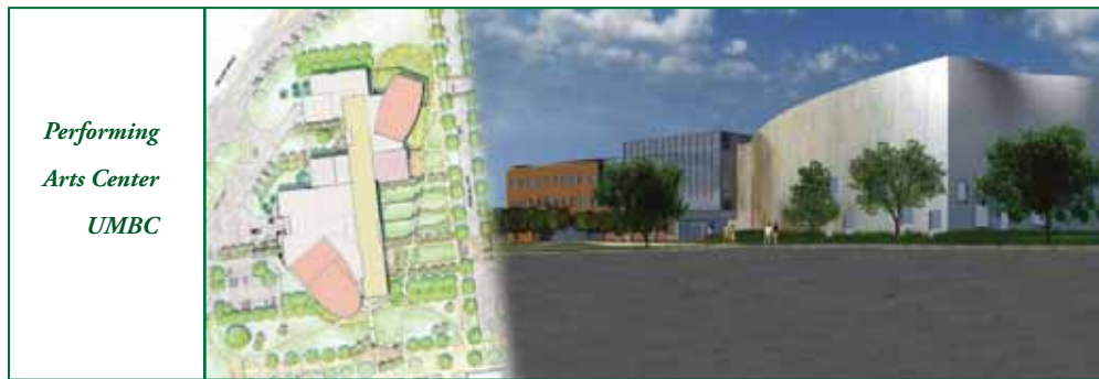
Performing Arts Center UMBC